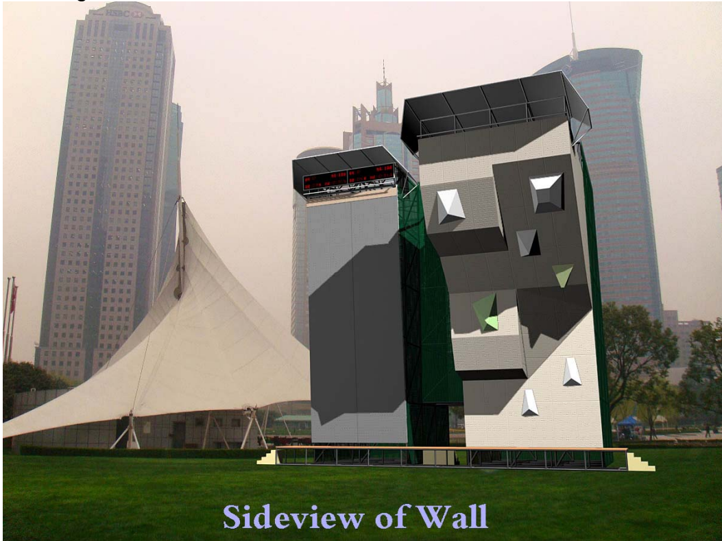
Sideview of Wall